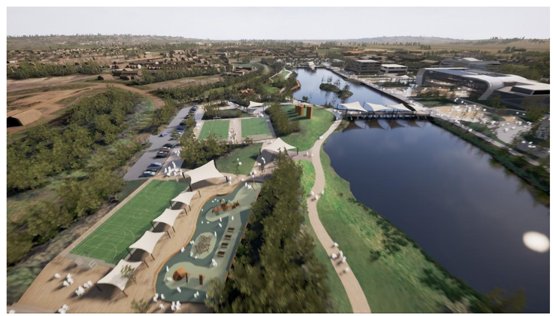
Figure 4: Pentre Awel

PSB members were invited to consider ways that Pentre Awel can work for local communities, local businesses and third sector