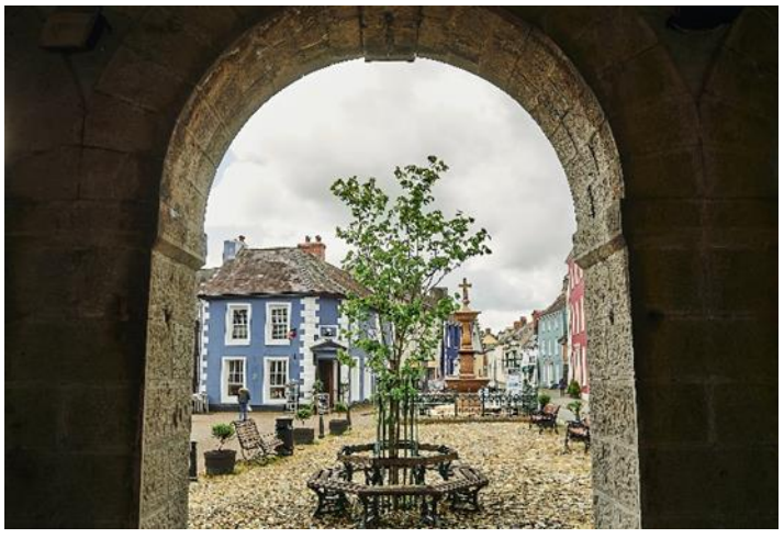
Figure 5: Newcastle Emlyn and Llandovery

PSB learned of the outcome of the work in Newcastle Emlyn on a Climate Resilience Plan in September 2021. This pilot project built on initial work undertaken in 2019 when the Healthy Environment Delivery Group (HEDG) requested engagement with a number of communities. In 2020, it was decided to do more detailed research in two communities to understand the public's perceived risks of climate change, the impact to the community and to see what action communities could take to better prepare for the effects of climate change. The project focussed on Newcastle Emlyn and Fishguard in Pembrokeshire. The engagement with the public sector, volunteer community and residents had to be undertaken on-line, because of the pandemic, which impacted on the number of participants.