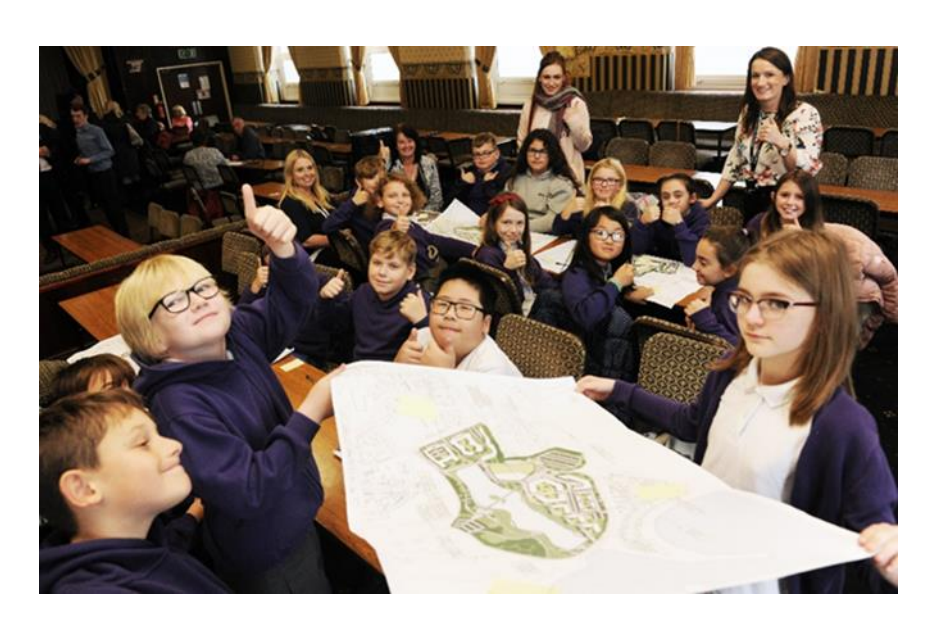
Figure 2: Transforming Tyisha project