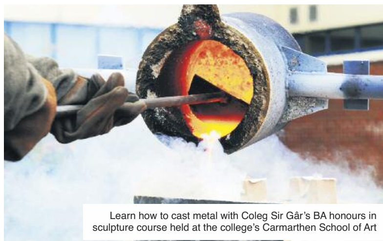
Learn how to cast metal with Coleg Sir Gâr's BA honours in sculpture course held at the college's Carmarthen School of Art

Coleg Sir Gâr, in partnership with University of Wales Trinity Saint David, offers a number of degree courses across Carmarthenshire.