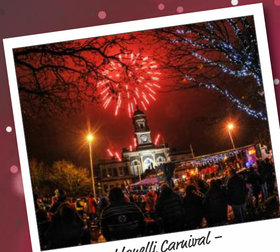
Llanelli Carnival - Nov 18th

Have your say on childcare in Carmarthenshire – take part in our survey. See page 12