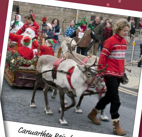
Carmarthenshire Reindeer Parade - Nov 19th